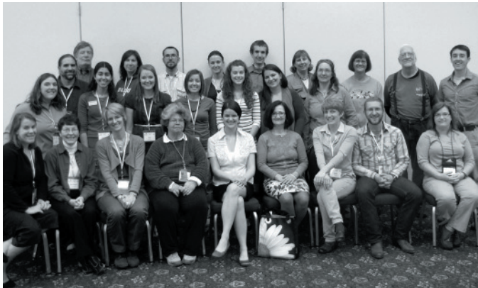
Graduates of the EE Certification pilot program