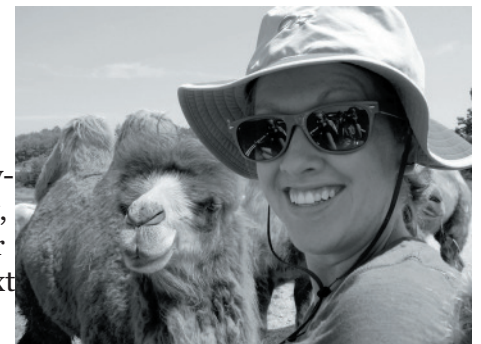
Campers enjoyed getting "up close and personal" with many of the Wilds' managed species!

Mallory can be contacted at (740) 638-5030 x2231 or msickle@thewilds.org .