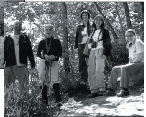
Enjoying the hike to Raven Rock