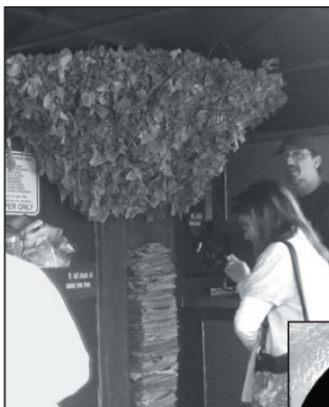
Green Machine’s newspaper tree