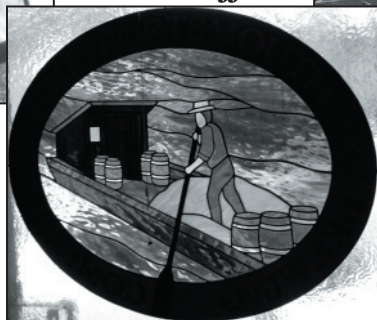
Stained glass of river traffic