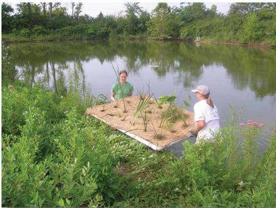
Launching the floating wetland at Twin Creek Preserve in Sharonville

In southwestern Ohio, Butler Soil and Water Conservation District (SWCD) is partnering with Miami University, a doctoral student at the University of Cincinnati, Grassroots Ecological Design LLC., and Yellow Springs Instruments to implement a FTW project. These partnerships between government, business, and education provide a great avenue for research as well as student involvement. Throughout the duration of the project, Butler SWCD staff and Miami University professors will be collecting and analyzing water samples from the FTW water bodies. Research during this project is very important to determine if FTWs can be used as a viable best management practice (BMP) for the treatment of water bodies. By partnering with local universities, the project will be readily accessible to researchers in order to determine the effectiveness of FTWs as a water quality BMP.