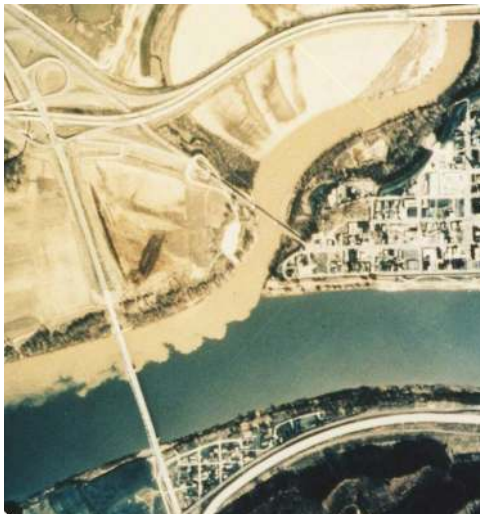
Scioto River and the Ohio River mixing zone at Portsmouth, Ohio

In Ohio, silt is the most common form of pollution in rivers and lakes. Soil running off the land causes the bottoms of waterways to become blanketed with sediment. If the sediment gets too thick, it can smother the tiny creatures at the bottom of the food chain.